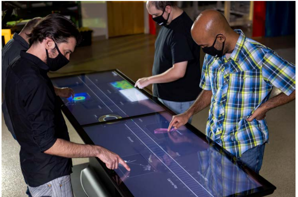
The Pano Dual 49" shown with the EM Spectrum multiuser exhibit.

The Pano Dual 49" touch table is built with Ideum's patented aircraft-grade aluminum frame that, like its chassis, is covered with a durable powder coat. It has a lockable enclosure and is ready for multi-person use in demanding environments. Pano systems are used in research labs, control rooms, and other essential areas. The Pano can also be found in busy public spaces, such as the Hoover Dam Visitor Center, the Museum of Science and Industry, and Science World British Columbia, among others. All of Ideum's hardware is backed by a three-year warranty.