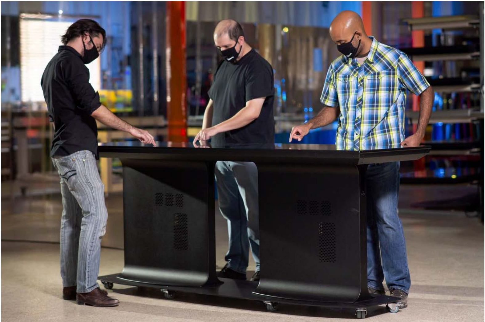
The Pano Dual 49" shown with optional casters.

The Pano Dual 49" is an ultra-wide multitouch table that is nearly 90 inches long. It comes with dual 49" 4K Ultra HD LG commercial displays rated 24/7. The Pano Dual 49" uses a Zytronic bezel-less PCAP touch sensor that supports 80 simultaneous touch points. The contiguous dual UHD displays provide a unique 7680 x 2160 pixel surface. The Pano is equipped with a powerful integrated Intel™ 10th Gen Core processor, NVIDIA™ discrete graphics card, and push-button power.